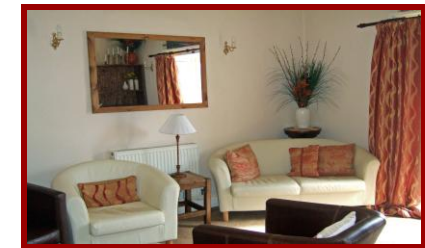
"Garden Room" ~ lounge with log/coal fire & patio doors overlooking the fish pool

The SAT Nav. will incorrectly direct you to the North/West side of the Ternhill Roundabout (Crossroads of A53 & A41). We are actually situated on the South/East side of that roundabout